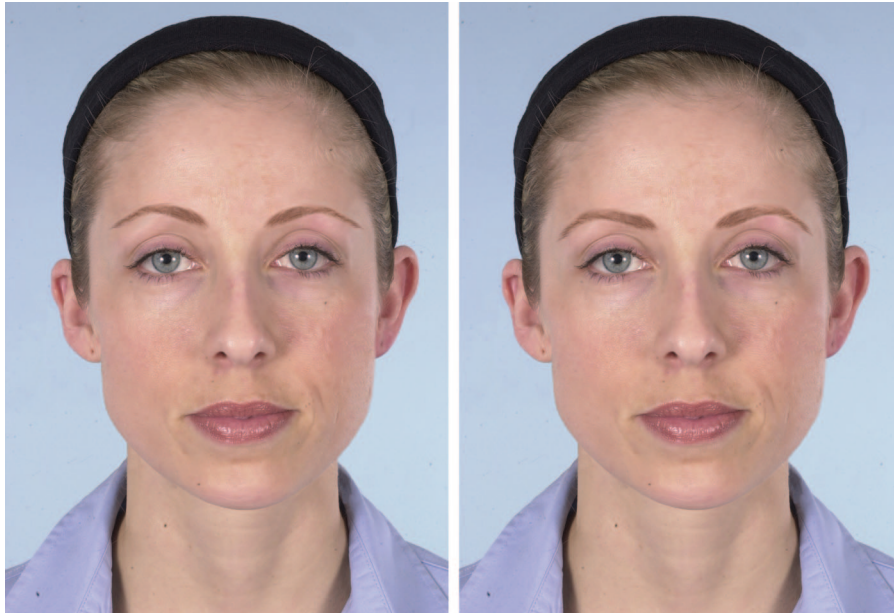
Fig. 5. Square face brow modifications juxtaposed with the Westmore ( left ) brow. The makeup artist version ( right ) differs from the Westmore version by softening the curve of the brow, with the lateral aspect pointing slightly more inferior toward the center of the ear.