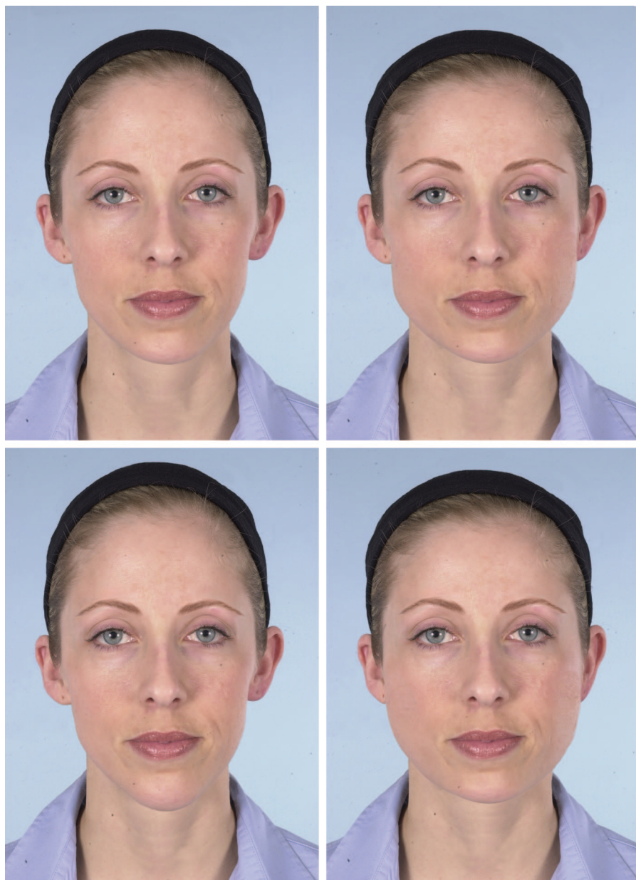
Fig. 2. Each model's face was morphed into four basic facial shapes: oval, square, long, and round. This technique was used to control for all other facial variables.

by which postoperative brow-lift results are often judged. However, there is not a consensus on the ideal brow shape and position. 1-5