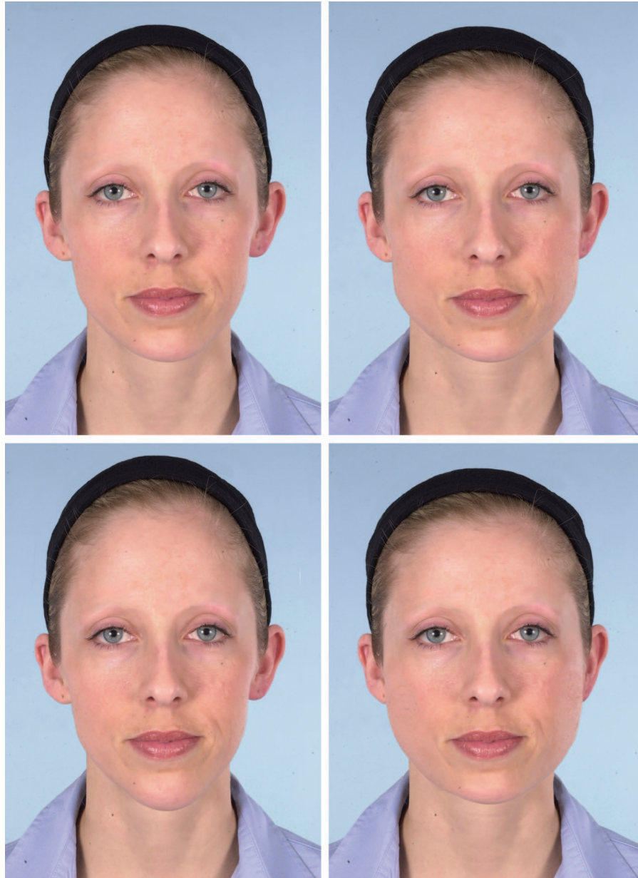
Fig. 3. Brows were digitally removed from all images. The Westmore and makeup artist's brows were then digitally applied to this template.

aging allows surgeons to change the brow shape and position without altering other facial structures. By isolating changes strictly to the brow, potentially confounding variables in adjacent structures are eliminated. Freund and Nolan used this technology to evaluate brow shape and position and to compare criteria of beauty between makeup artists and plastic surgeons. 2 They found that despite variability in the criteria for the aesthetic brow in the plastic surgery lit-