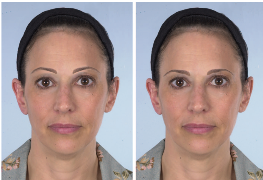
Fig. 6. Long face brow modifications juxtaposed with the Westmore ( left ) brow. The makeup artist ( right ) keeps the brow low and straight. High arches are avoided, as they may augment the appearance of an already long face.

points toward the top of the ear to enhance angularity of the face (Fig. 7). 7